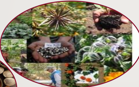
Biodiversity and Ecosystems