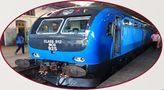
Transport, Energy and Industry