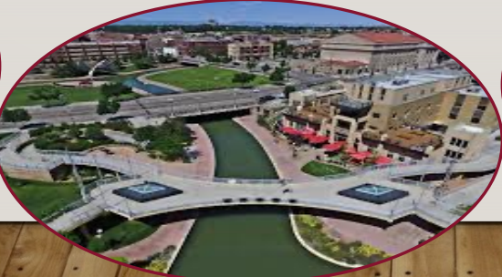
Human settlement and Infrastructure