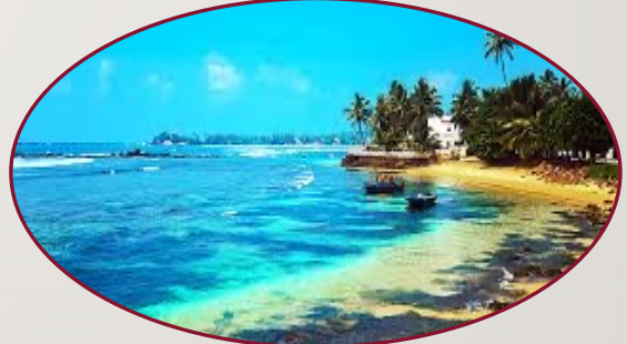
Coastal and Marine