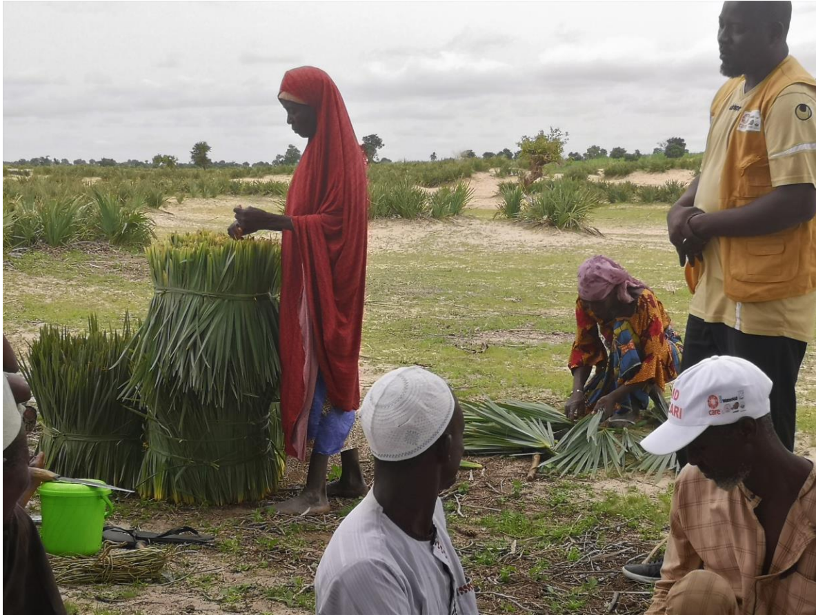
Women harvest palm leaves for sale on a pasture management area