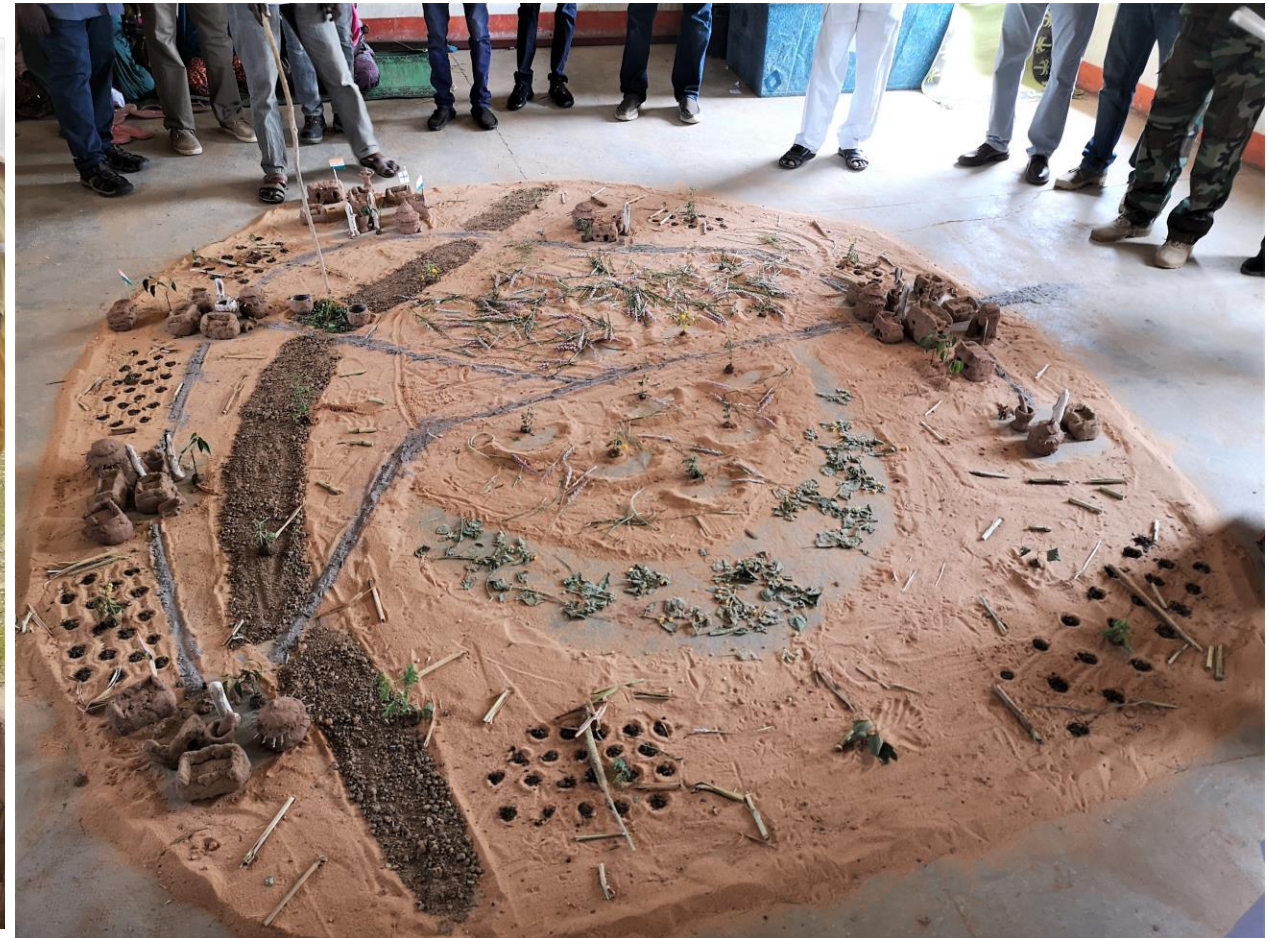
A model illustrating integration of pasture management and other climate resilient practices