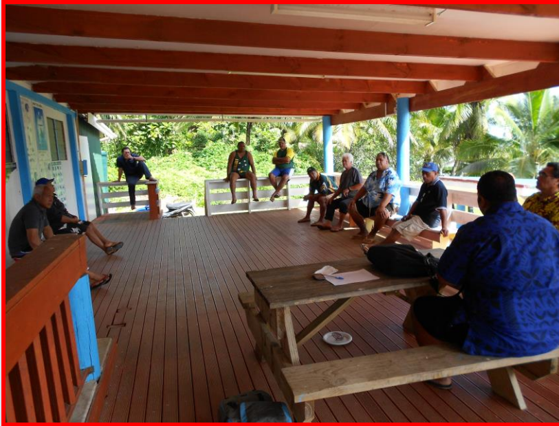
Photo: SRIC-CC PMU meeting with the Mangaia Fishing Association to discuss their proposal under the SRIC-CC Small Grants Programme.