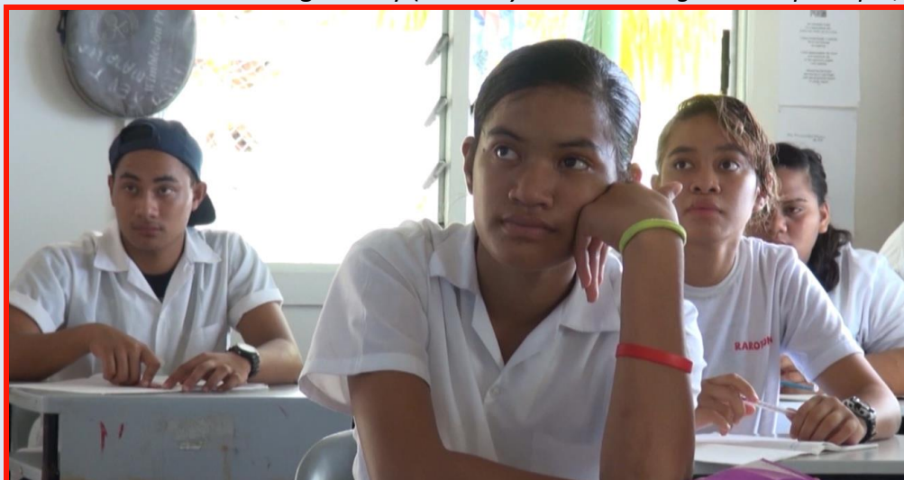
Photo: The Northern Pa Enua students are looking forward to the start of the training programme on Rarotonga. The Rarotonga lagoon and Oceans will be a part of their learning grounds during the