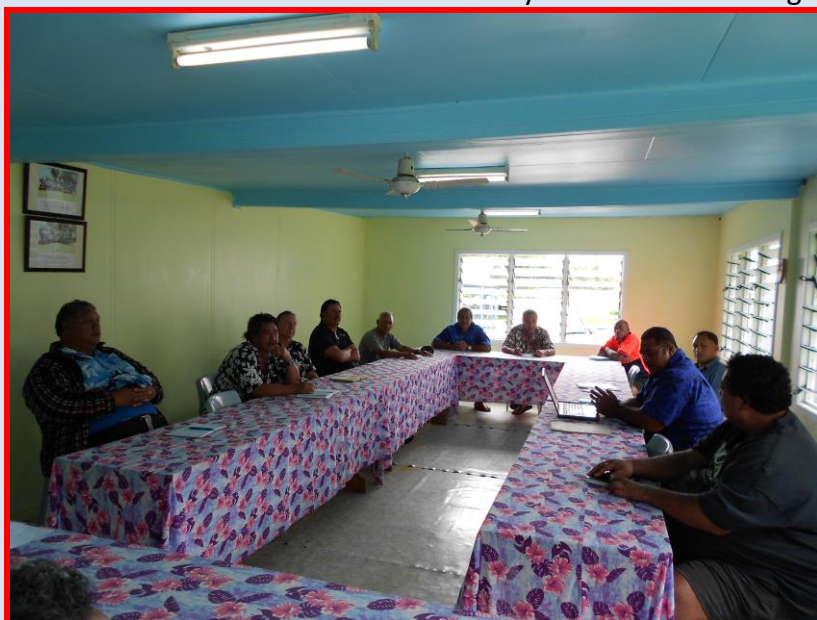
Photo: SRIC-CC PMU meets with Mangaia Pa Enu Island Council to finalise arrangements for delivery of the MGLAI project and the Tamarua household water tanks project.

Photos: Meeting between SRIC-CC PMU and the Mangaia mainstream and home gardening Farmers. The meeting attracted many people. The photo to the right is a home gardens project green house that will be modified to also be a nursery for farmers working on the MGLAI project.