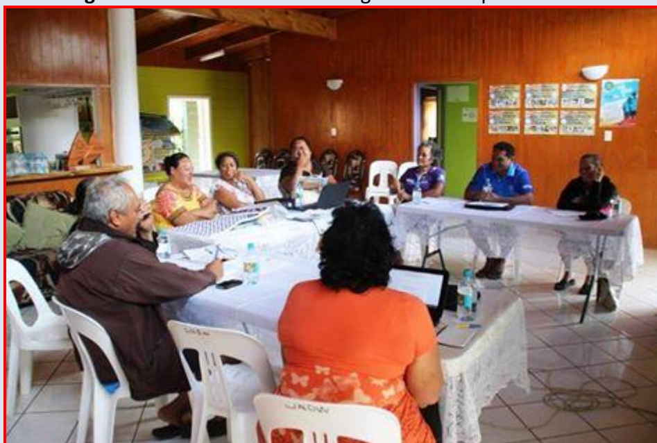
Photo: Climate Change Platform key stakeholders meet to discuss progress of CC and DRR activities. Dr Teina presented the progress of SRIC-CC. This forum also assists in strengthening coordination between stakeholders.

Knowledge materials – the SRIC-CC Programme was presented at the Climate Change Platform Meeting.