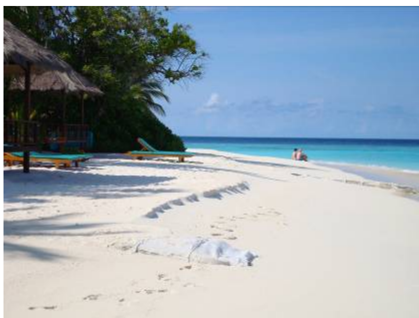
Figure 1. Temporary (i.e. removable) beach protection works.

The company has been environmentally- and culturally-minded in the development of its resorts and Corporate Social Responsibility programmes from the initial planning stages of each location housing a Banyan Tree or Angsana Resort and Spa. For example, The Banyan Tree Maldives Marine Laboratories at Banyan Tree Maldives Vabbinfaru, Angsana Resort and Spa Ihuru and Angsana Resort and Spa Velavaru actively work to protect, conserve, conduct research within, and educate about the coral reef environments surrounding the resorts and adjacent inhabited islands. The main conservation projects include coral reef regeneration (through regrowing broken fragments of corals on three Electric Reef projects and 15 coral gardens), sea turtle conservation, and beach erosion monitoring and prevention (Figure 1).