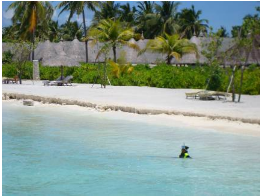
Figure 2. Beach erosion at the Four Seasons Resort.

Erosion management is practiced, including beach nourishment. Dredging has accelerated beach erosion in some parts of the resort (Figure 2).