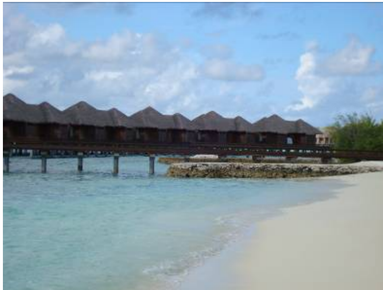
Figure 4. Overwater bungalows and coastal protection at Full Moon Resort.

Overwater bungalows were first built in 1993 (Figure 4). At that time there was no knowledge that the sea level is rising. Insufficient height was allowed between the ocean and the floors of the bungalows – guests complain of the noise from the waves hitting the floor. Connecting walkways were rebuilt in 2006, after the tsunami. It raised awareness of the risk of high sea levels.