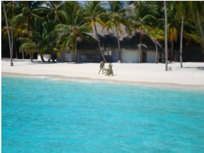
Figure 3. Beach clean up at the Six Senses Resort. Sand is pumped onto this beach at frequent intervals.

From July 2008 Six Senses resorts will be plastics free. The company is working towards a sustainable purchasing policy, with a red list (e.g. endangered species – no caviar or local lobster is served) and a green list. The company is seeking Green Globe certification – Soneva Fushi is already certified.